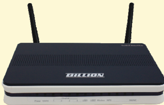
▲ BiPAC 6300NXL