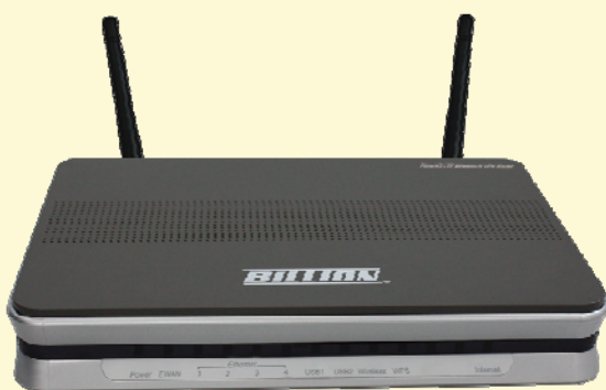
▲ BiPAC 6300NX