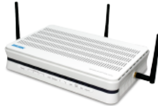
▲ BiPAC 7404VNPX