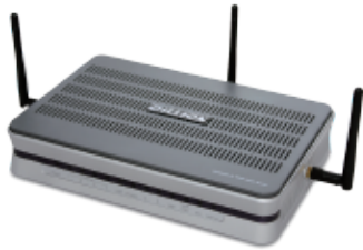
▲ BiPAC 7404VNOX